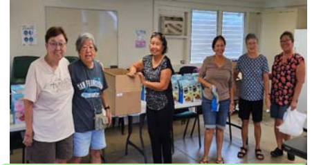
Spring Fundraiser Pick Up