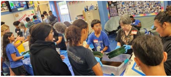
Genki Ball Making